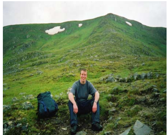
Looking up to Tom a' Choinich