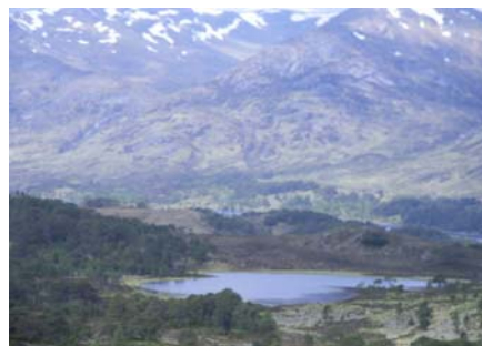
Loch an Eang