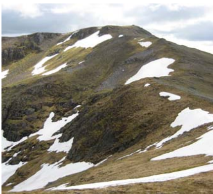
Bealach between Carn Eighe & Mam Sodhail