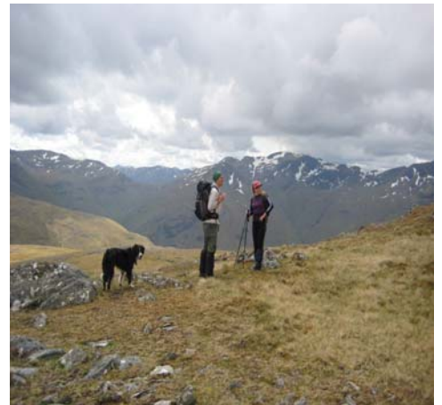
Col S of Cairn Ch Gahairbh - SW Affric view