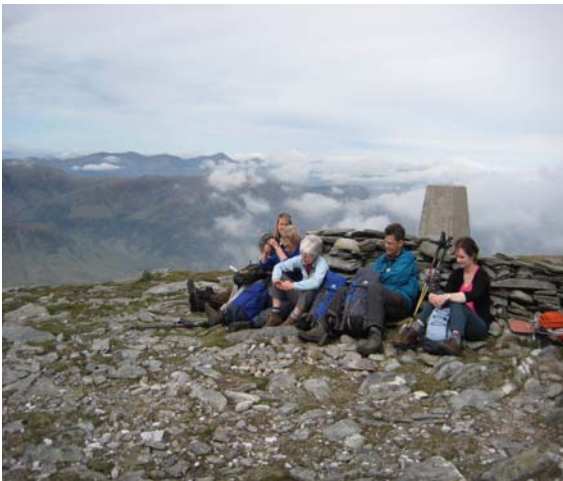
Cairn on Tom a' Choinich