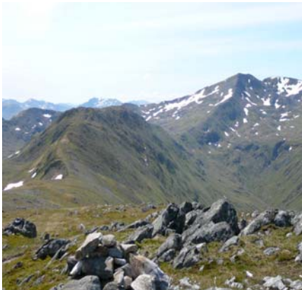
Leaving Carn Eighe