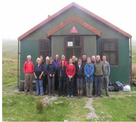
Our 2 day walking group