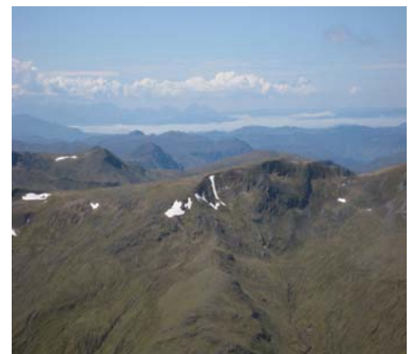
Cullins from Mam Sodhail