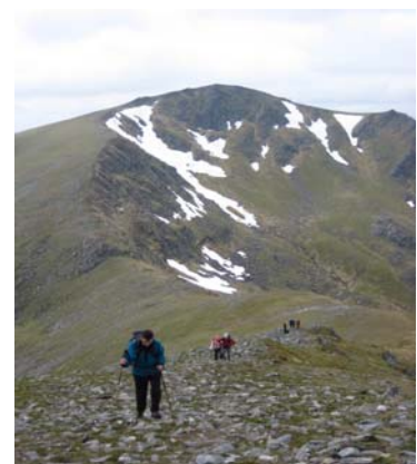
West to Sgurr Fhuar Thuil