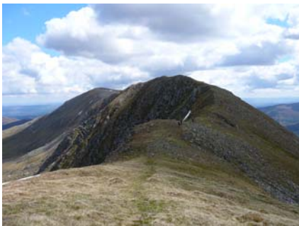
Carn Eighe ridge