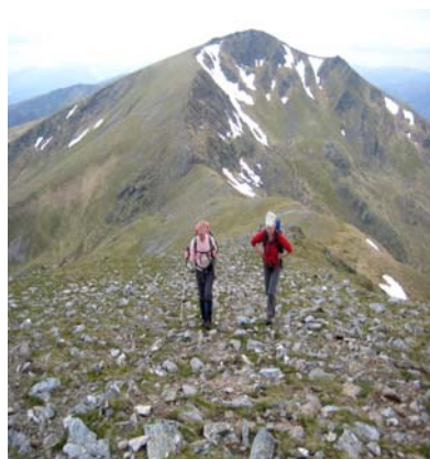
West to Sgurr Fhuar Thuil