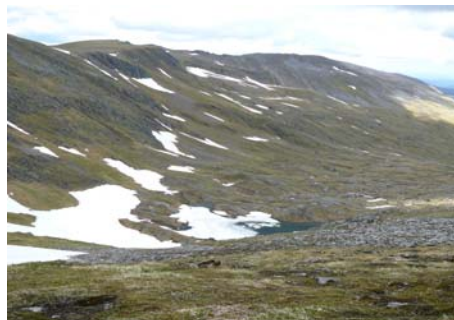
Lochan below Carn Eighe ridge