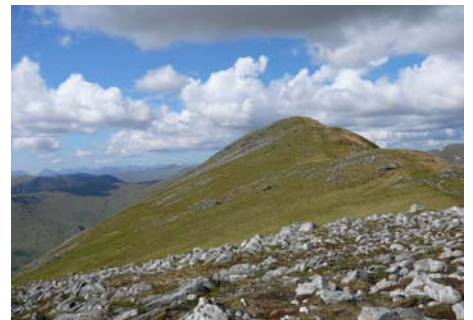
View from Carn Eighe