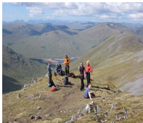
Torrignons from Mam Sodhail